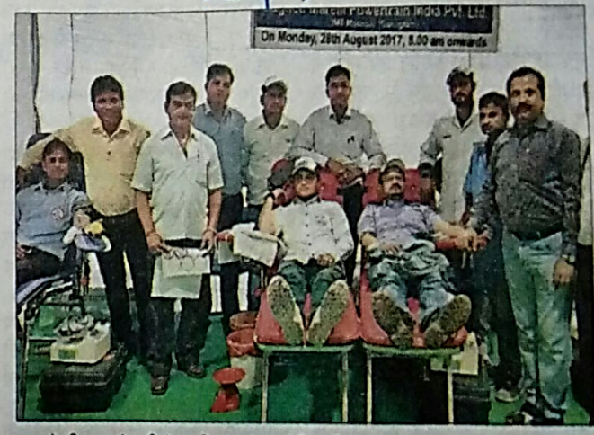
रोटरी क्लब रेवाड़ी मेन की ओर से आयोजित शिविर में रक्तदान करते रक्तदाता।

कार्यक्रम के दौरान क्लब की ओर से रक्तदाताओं को स्मृति चिन्ह देकर