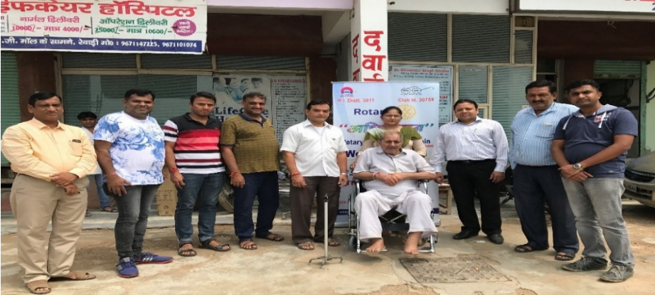
रोटरी क्लब ने दिव्यांग को दी व्हीलचेयर